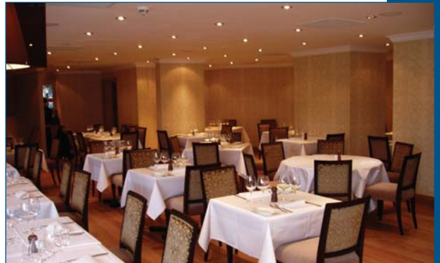
The Dolce Vita Restaurant, Guildford Surrey: CMPB acted as QS and Project Manager for this fast track fit out project completed in November 2005.