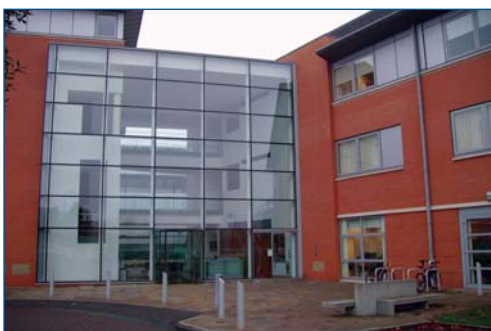
C M Parker Browne's new Manchester office at the Manchester Technopark, Birley Fields, Manchester