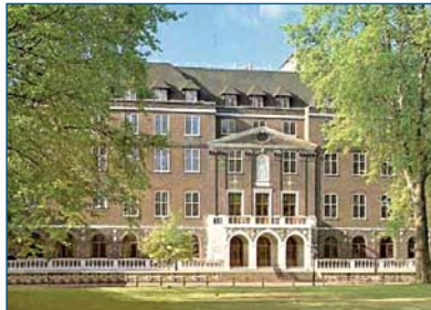
Church House, Westminster where CMPB are Quantity Surveyors for this, the parliamentary home of the Anglican Communion.

Today, the building is the headquarters of the Archbishops' Council and all its Boards and Councils as well as of the Church of England Pensions Board and the National Society.