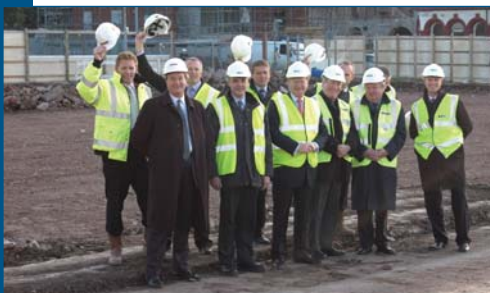
Hats off to the team for the start on site of Liverpool's most prestigious residential development, 'L1'. Our CMPB staff are shown here with the client, Windsor Developments (Liverpool) Ltd and representatives from the main contractor, Laing O'Rourke and from architects, Downs Variava.